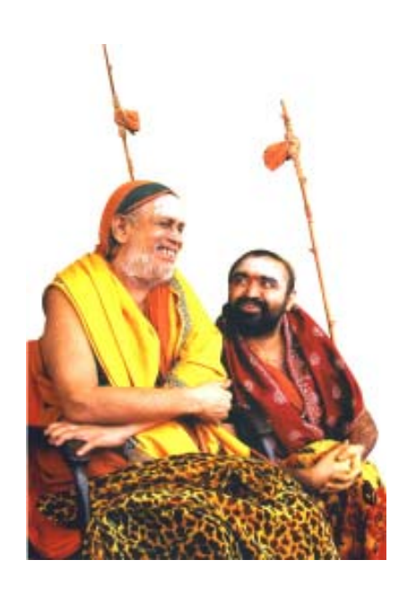
Our Pranams to Their Holiness